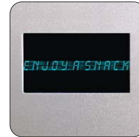
Scrolling message display with multi-language programming lets you highlight products and specials to your customers.

In order to bring you the best products possible we continue to improve product design and performance and as such specifications are subject to change without notice.