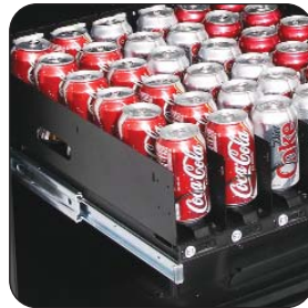
Each sturdy steel tray is equipped with heavy duty roller slides and hold up to 60 can or bottled beverages.