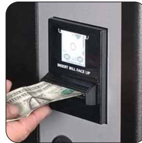
MDB Payment system ready. Includes coin, bill, and card reader acceptance.