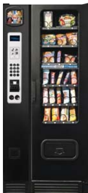
SC100/Cold & Frozen Cold & Frozen Food Merchandiser and optional control tower.