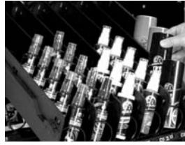
Easy first-in-first-out loading!