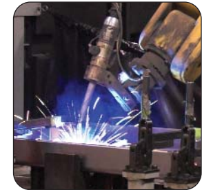
Fully Welded Seams and Internal Bracing for Years of Service