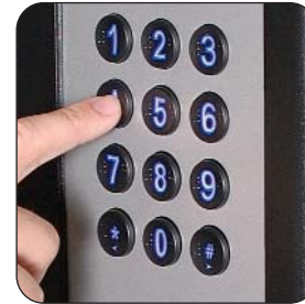
Large Braille Identified Keypad