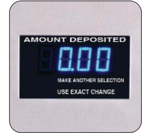
Large LED Displays Currency Deposited and Selection