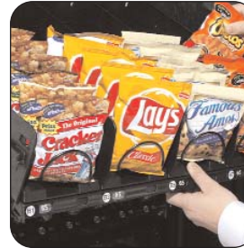
Easy First-In-First Out Loading