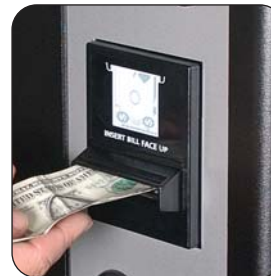
$1 & $5 Bill Acceptor Standard