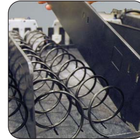
Trays are Re-configurable on Location for Varying Product Sizes