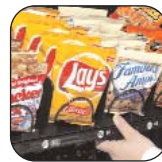
Easy First-In First-Out Loading