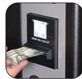
$1 & $5 Bill Acceptor Standard