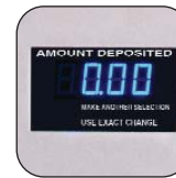
Large LED Display And Buttons For Easy Use