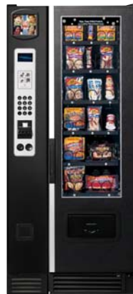
SC100/CF1000 Cold Food Merchandiser and optional control tower.