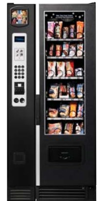
SC100/FF2000 Frozen Food Merchandiser and optional control tower.