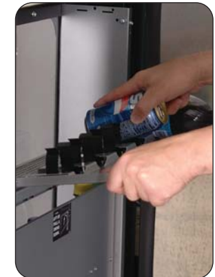
Tilting Product Display For Simple Selection and Pricing Changes