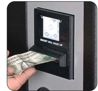
$1, $5, $10 & $20 Bill Acceptor Standard (Set for $1 & $5 from the factory)