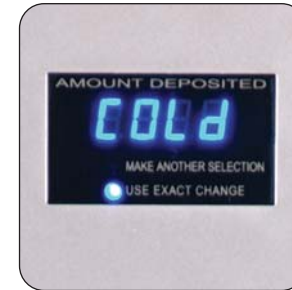
Bright blue LED display with point of sale message or credit display options