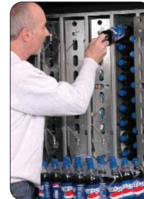
Easy Loading Product Stacks With Convenient Case Support Rack